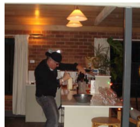
Your President testing out the new Arlberg kitchen!

You will be happy to know the work done to the downstairs kitchen saw Arlberg given its first 100% pass by the inspector – well worth the effort! Money spent on essential spa maintenance has also been given 100% approval and we are well on the way to finishing the remainder of the necessary upgrades for Season 2010.